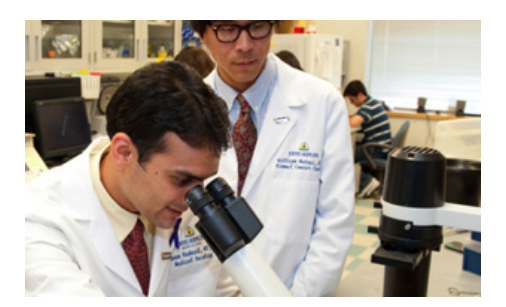
Since its inception, the Pancreatic Cancer Action Network has worked to build critical mass in the community of scientists studying pancreatic cancer.

We continued to raise our voices and, thus, awareness about the disease.