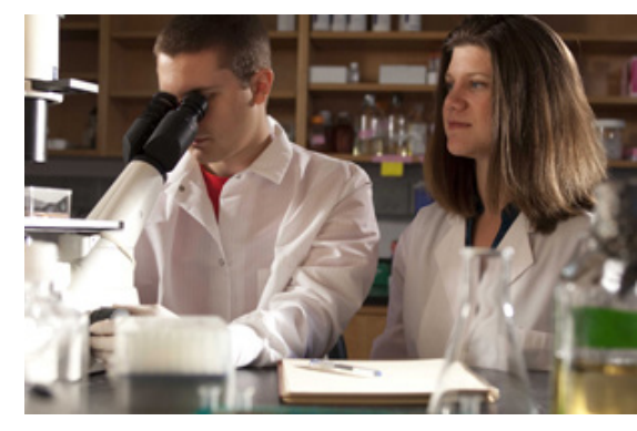
Scientists have made significant progress over the past decade in understanding more about pancreatic cancer.

Times these published papers have been built upon and cited in other publications