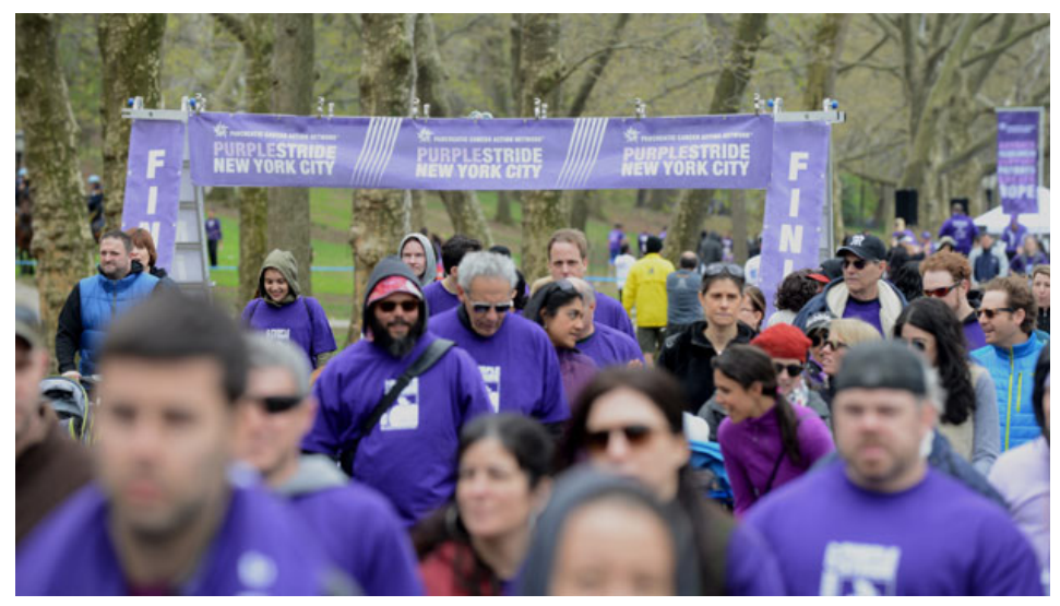
Enthusiastic participants showed their purple passion at PurpleStride New York City in April 2013.